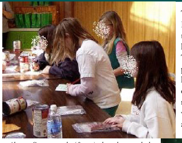
Above: Scouts made (& ate) chocolate asphalt and concrete (not pictured) in the Civil Engineering Session.

Our Civil Engineering session was led by Crystal Freeburg. The girls learned about civil engineering through a session called 'Chocolate Asphalt'. The session taught the girls what asphalt is made of by making their own chocolate asphalt using ingredients such as melted chocolate, walnuts, coconut, oats and sprinkles. Each ingredient represented a real component of asphalt. They each