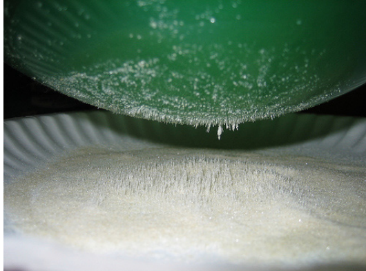
Above: Electric Gelatin during the Electrical Engineering Session

The first activity was "series vs. parallel circuits" where the girls learned about how the brightness of a light bulb is affected by having multiple bulbs placed in series versus parallel with one battery, and then how the brightness of