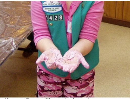
Above: Super Slime (polymer) in progress during the Chemical Engineering Session

and determine which slime it was. This emphasized how engineers have to perform tests and know the properties of the materials with which they work and how they can use tests to resolve unknown situations. The tests included a description and a slime rating (1 = not)slimy to 5 = very slimy), a slow poke test, a quick poke test, a slow pull test, a quick pull test, and a bounce test. Although both slimes felt very similar, they did have a slightly different texture. They performed fairly equally during the tests except for the pull tests. Gloop breaks or tears distinctly almost immediately when pulled while Super Slime can stretch almost across the room! Based on their test results, the girls were successful in identifying the unknown(s). For the most part, the girls really enjoyed this session, although some wish we had had gloves for them to wear! They really got MESSY!